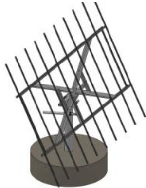
DEGERtraker 5000HD with concrete foundation for open land installation