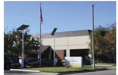
Module assembly and sales center for the Americas - Camarillo, CA