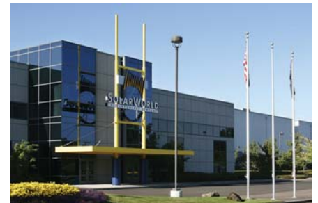
Crystal growing, wafering and cell production - Hillsboro, OR