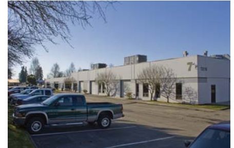
Silicon reprocessing - Vancouver, WA